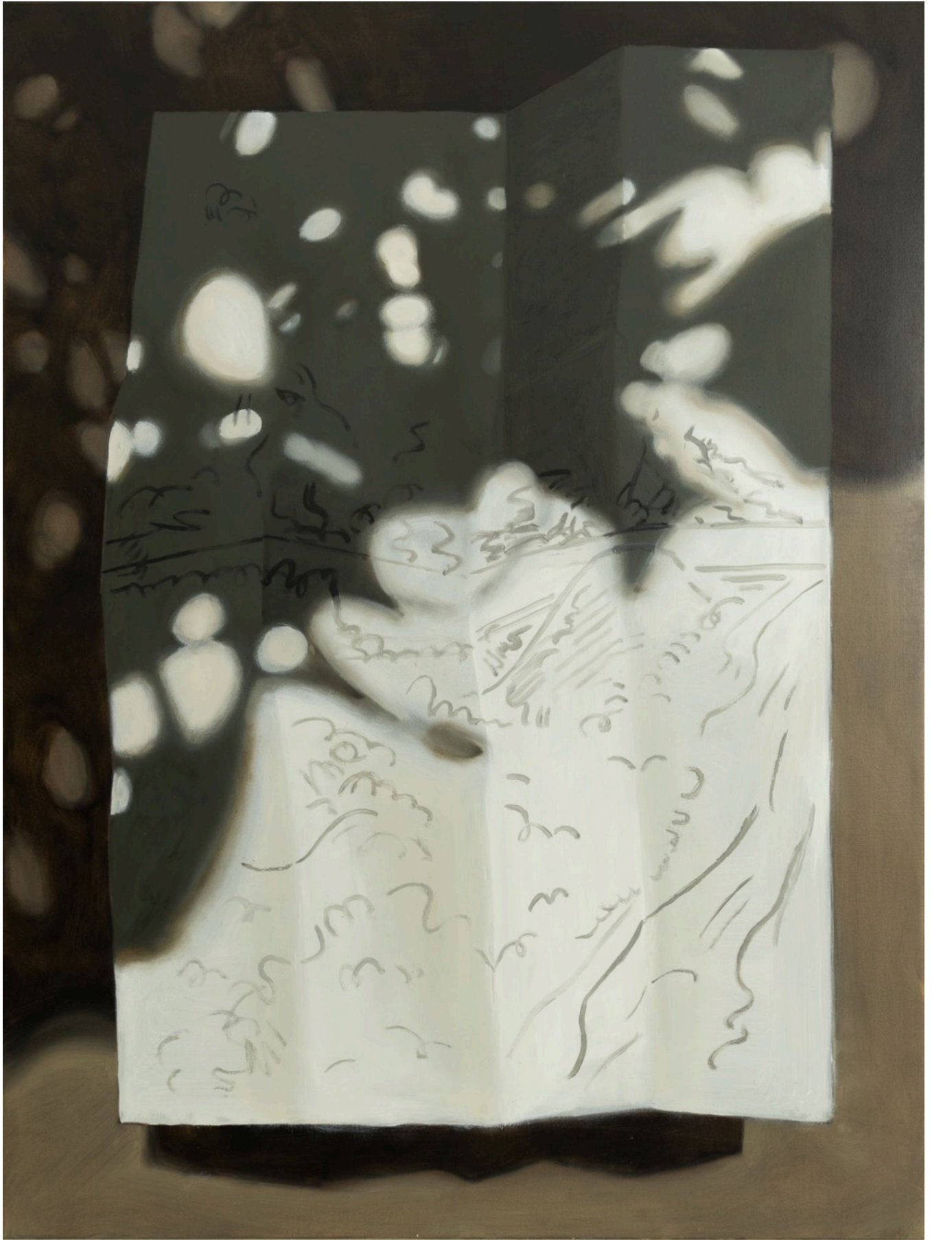
Study of mountain top 2026