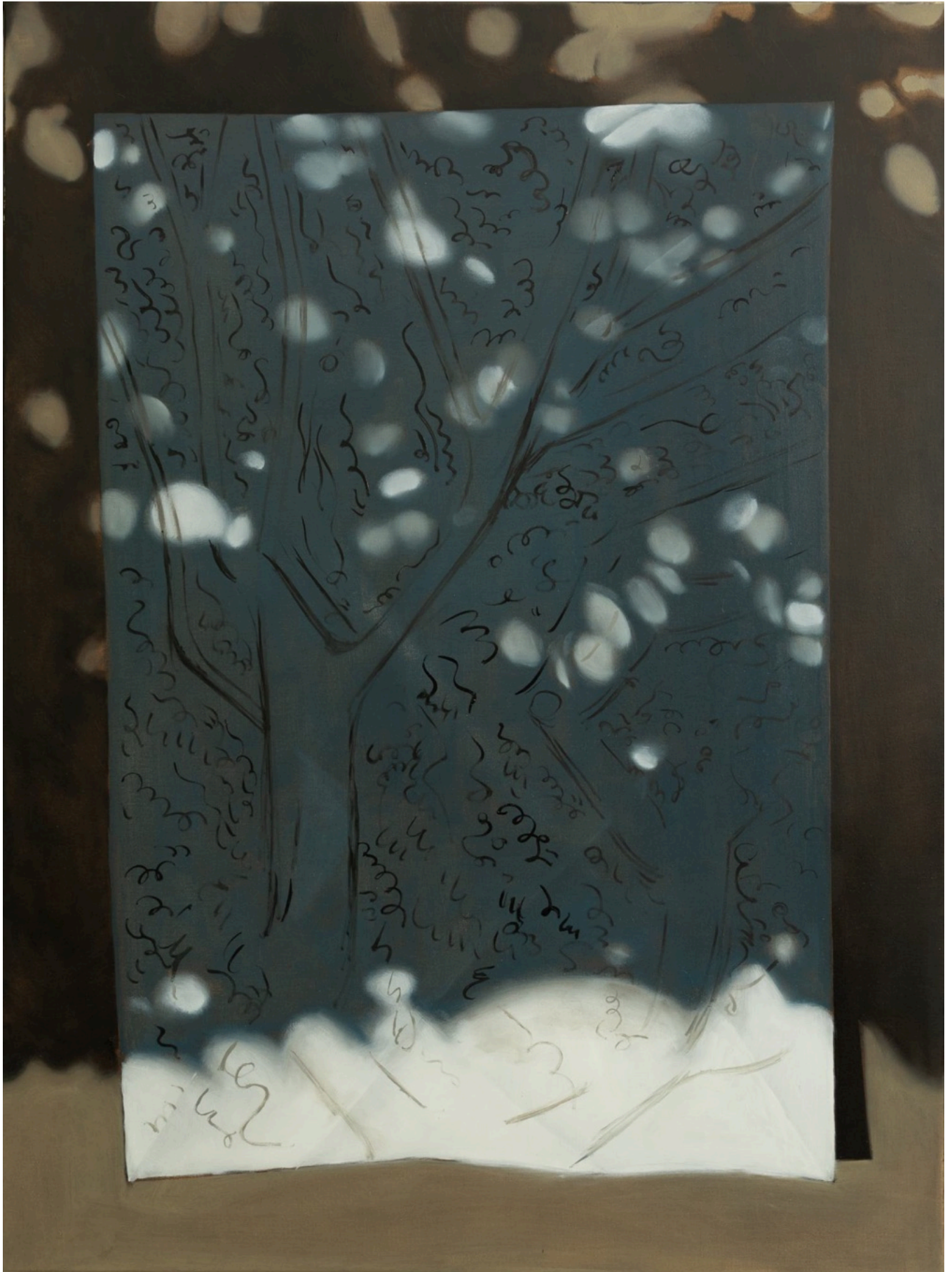
Study of canopy 2026