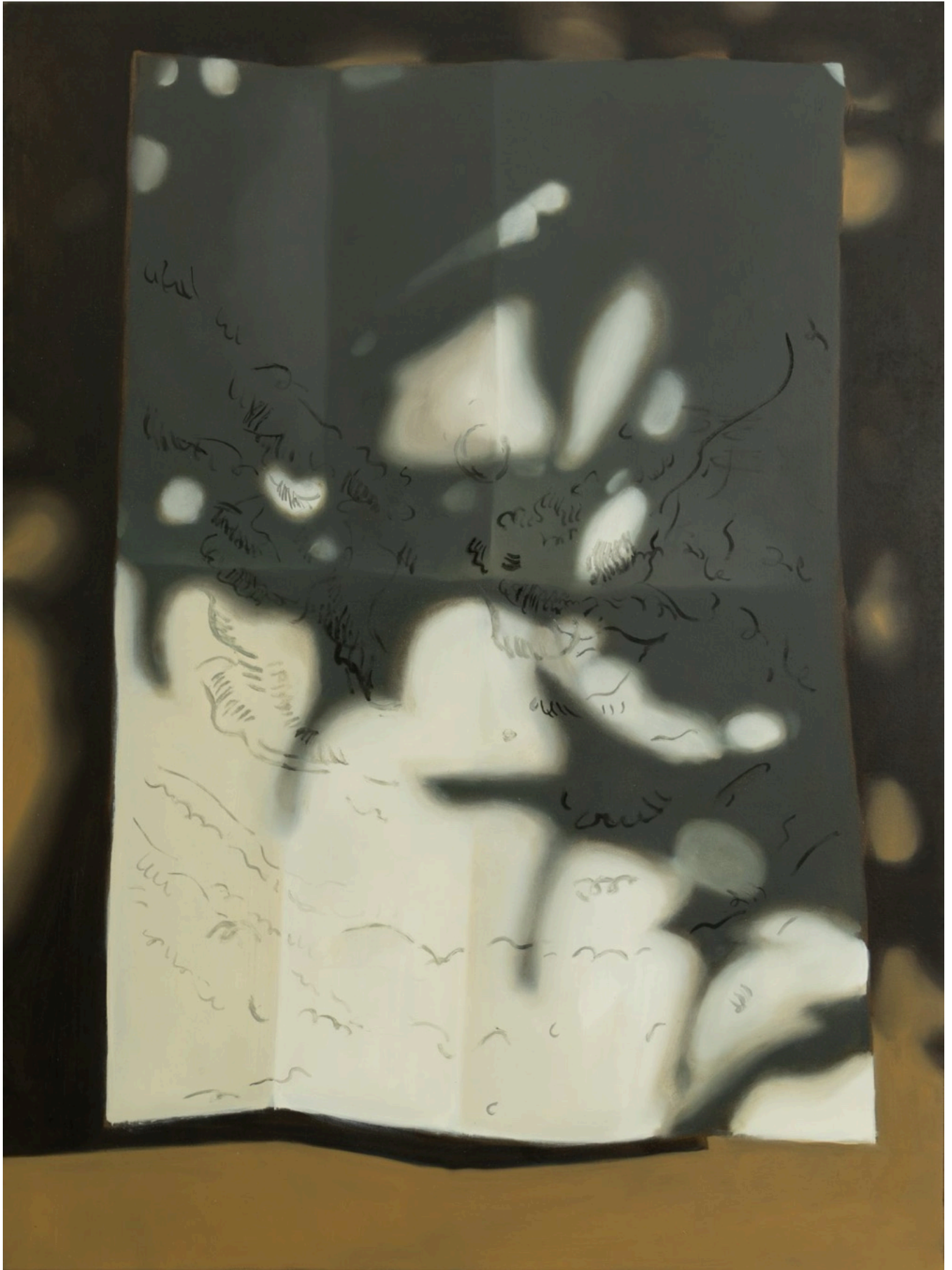
Study of silver moon 2026