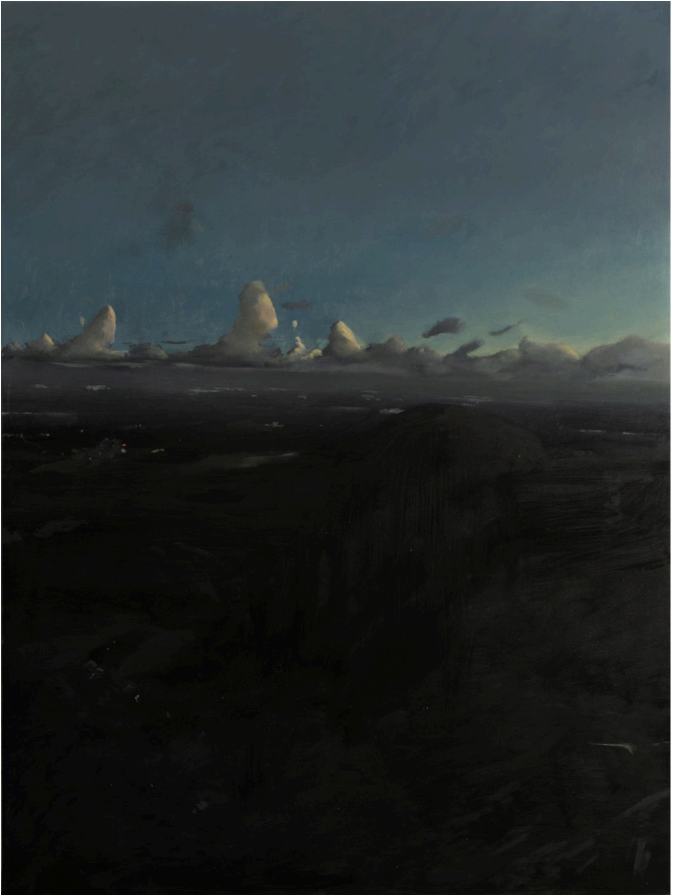
Mountain Top 2026