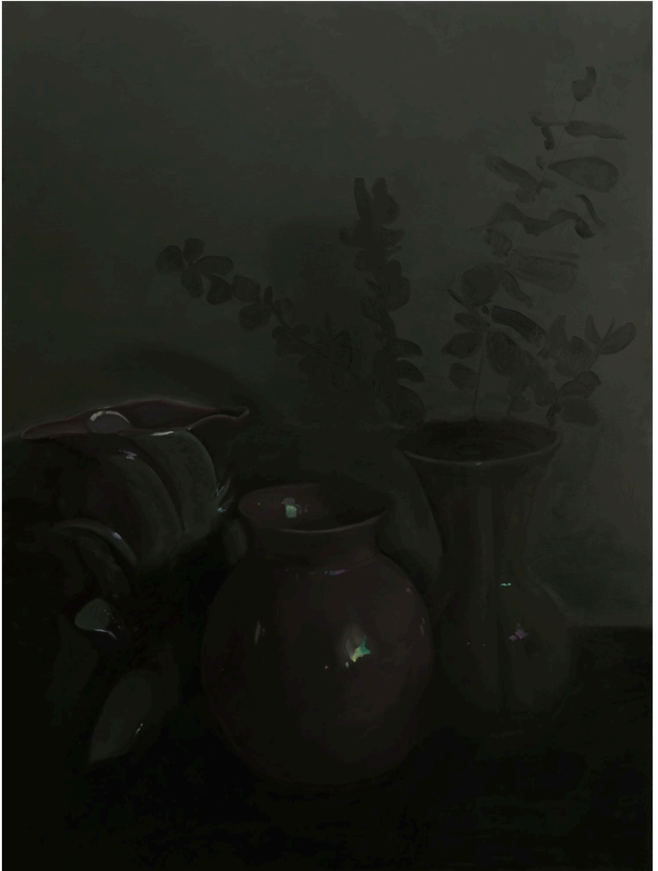
Low Light Still Life 2026